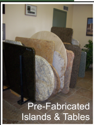
Pre-Fabricated Islands & Tables